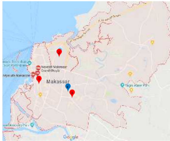
Figure 2. The Fire Station Location and Disaster Area

The available map in OSM is plotted to QGIS consists of the length and the classification of the road and used to analyze the optimum route. The Indonesia highway classification rule no. 38 (2004) divide the road according to function with arterial, collector, and local [7]. According to the classification, the velocity of the vehicle (free flow speed) also determined in rule no. 34 (2006) for arterial roads 70 – 120 km/h and 60 – 90 km/h of collector roads [8]. Further, the nearest station would help each other to minimized the disaster and selected three stations to encounter the fire in CBD residence area. The coordinate of the fire stations is available on OSM and google map then pointed in QGIS as the start and finish of fire rescue route. The following figure is showing the location of the fire station with a red point and the blue point is the disaster area in Makassar map from google map facilities.