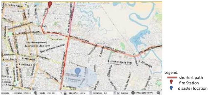
Figure 3. The optimum route of fire station 1

to the disaster area in Makassar CBD residence area in figure 3, 4, and 5 respectively. The figure describes the starting point of the fire station through the road network according to road graph analysis in QGIS to the fire disaster location. The route only through the arterial and collector road in the road network with the red line. The potential area of disaster is marked with the blue circle that showed the total residence area surround the CBD. The optimum route would guidance the fire rescue to through the road with optimum distance and time.