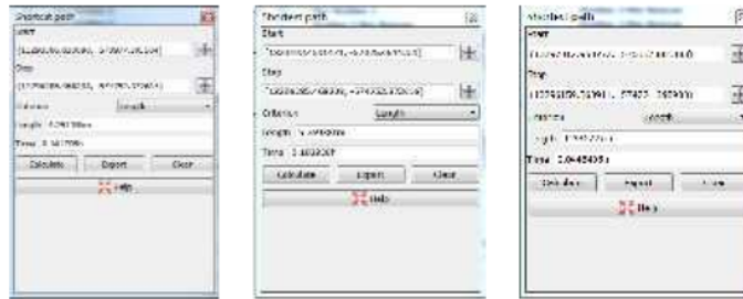
Figure 6. Length and time of fire station to disaster area

The total distance from fire station 1 is about 4.25118 km and the time taken to reach the place is computed as 0.141706 hours which is equal to 14.1706 minutes, for the fire station 2 the shortest path is 5.76988 km the time taken to reach is about 0.192329 hours which is equal to 19.2329 minutes, and for the fire station 3 the shortest path is 1.33622 km the time taken to reach is about 0.0445405 hours which is equal to 4.45405 minutes shows in figure 6. This study is also can be used for alternative solution by recognizing the route between the two known address, by linking the entire data base of address.